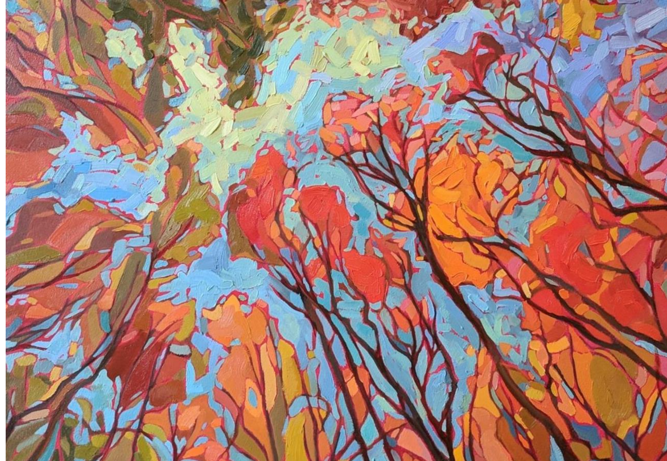
Under the Same Blue Sky, 2019