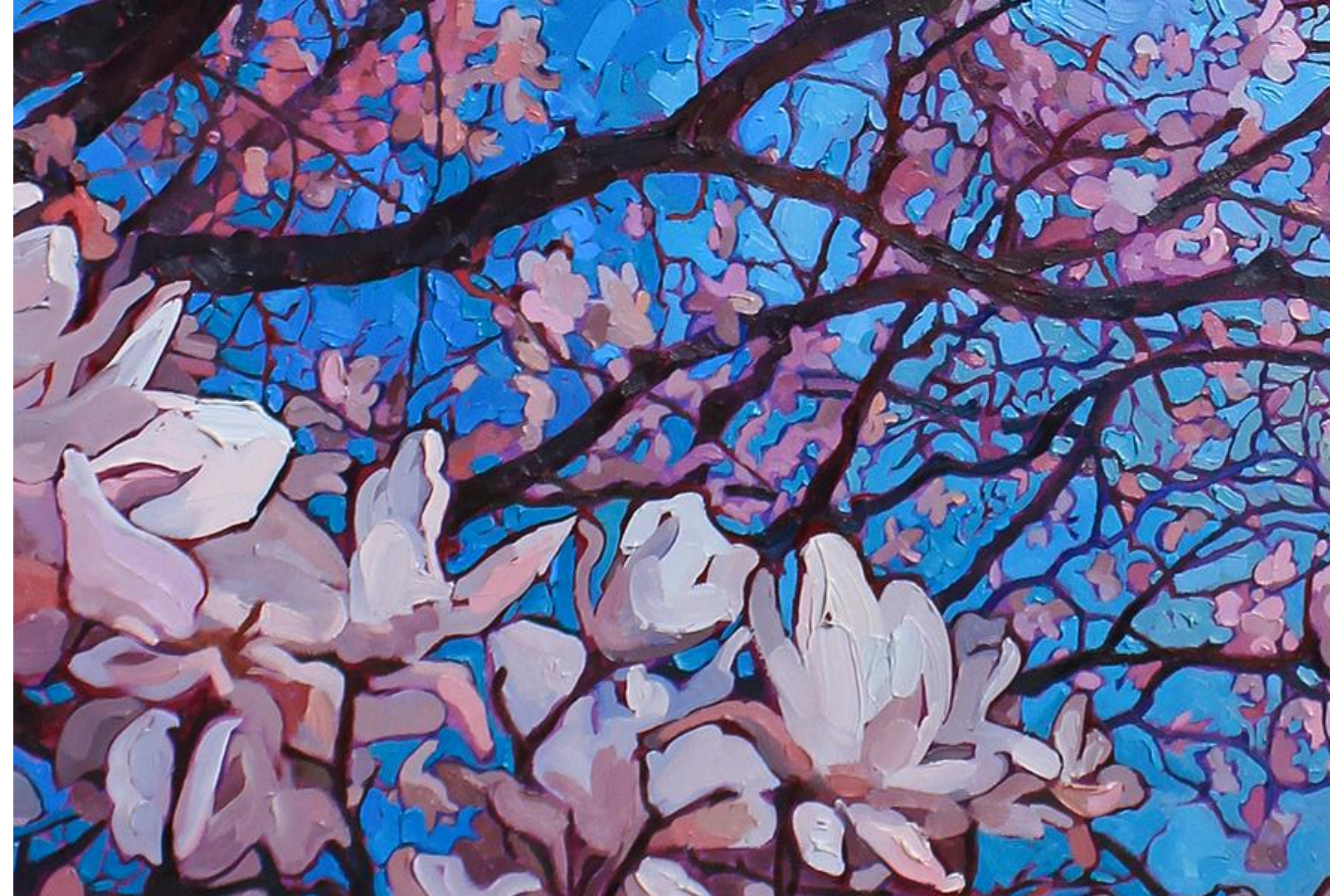
New Beginnings, 2019