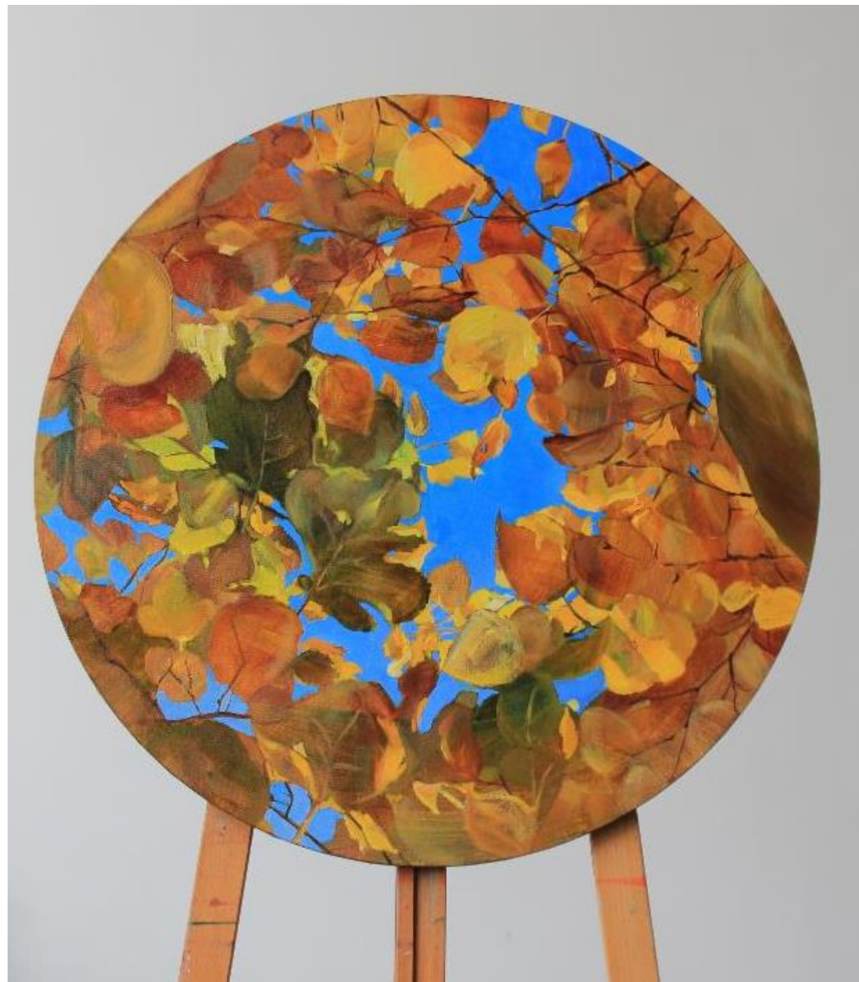
Autumn brocade, 2019